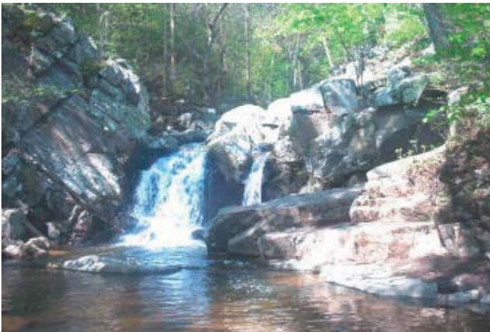
View along Scott's Run Hike

Here are the directions to the trailhead: Take I-495 to VA 193 (exit 44); VA 193 west 0.3 mi to East Parking Lot, on right with sign. If this lot is full, continue a little farther on VA 193 to another lot and begin hike from there. If you can't find us, call my cell at 703-585-6881 to find out where we are. I'll be wearing a Jaycee shirt of some sort.